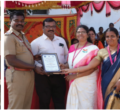
TNAI Zonal Competition Award