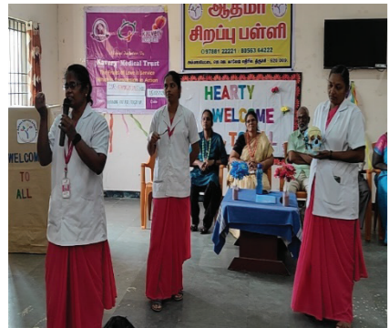
Health Education by Our students