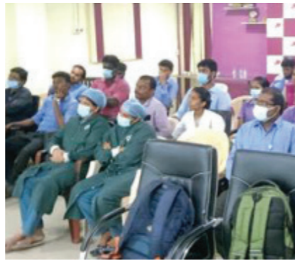
KAFFEE with Kurrency