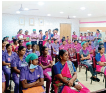
Employee Mental Wellness