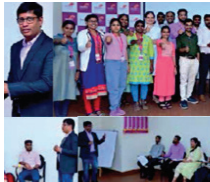
Leadership Initiative for Transformation