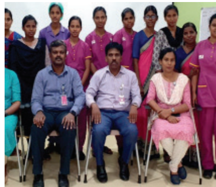
Employee Soft Skill Training