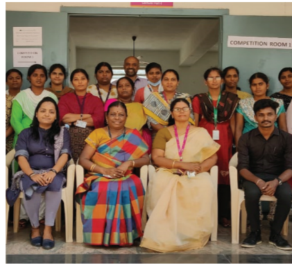
World Skill Zonal Competition