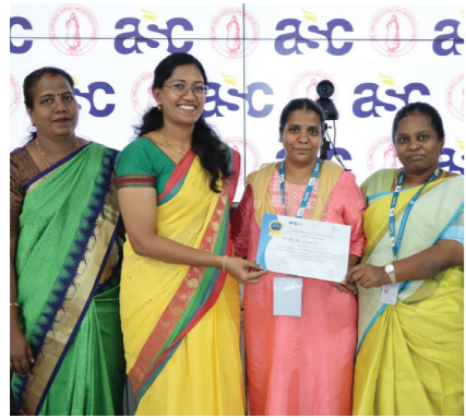
Simulation Training Award