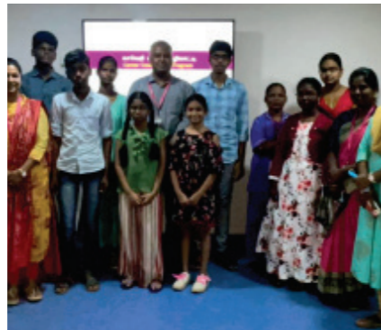
Career Guidance Program