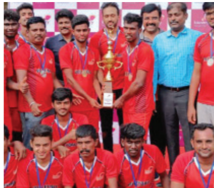
Uniting in Sportsmanship